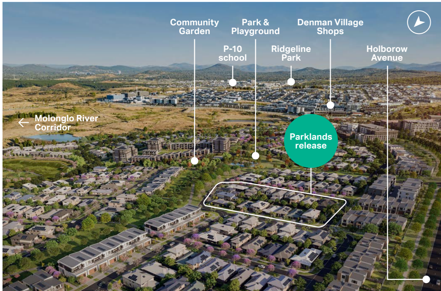
Artist's impression. Image is indicative only.