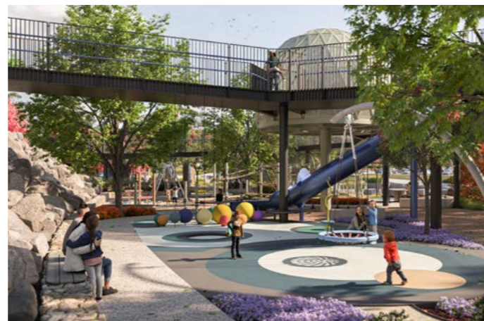
Denman Village Playground. Artist's impressions. Image is indicative only.