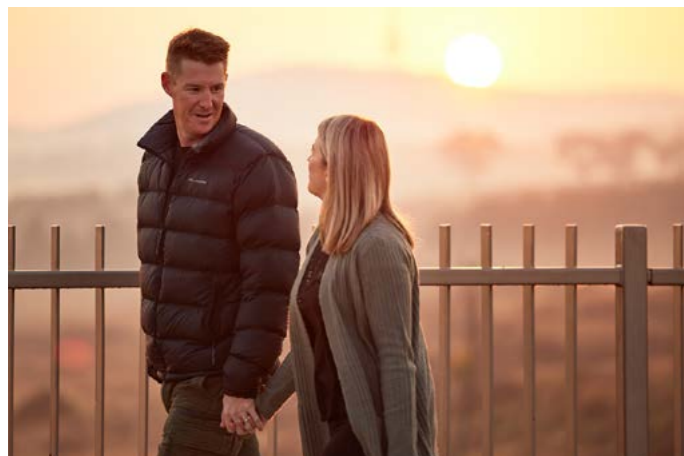
Within walking distance of Denman Village Shops.

Blocks are anticipated to be build ready in late 2024.