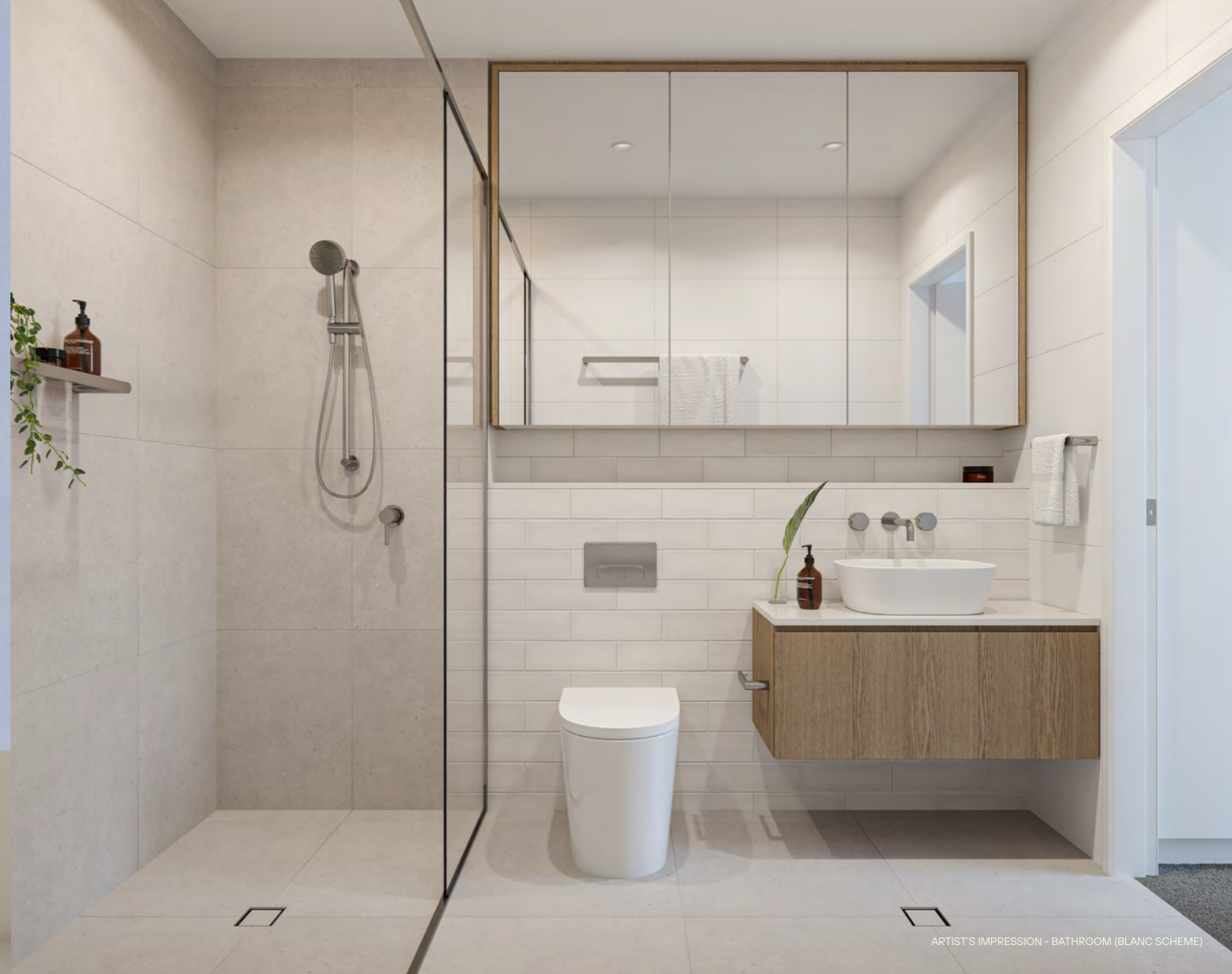
ARTIST'S IMPRESSION - BATHROOM (BLANC SCHEME)