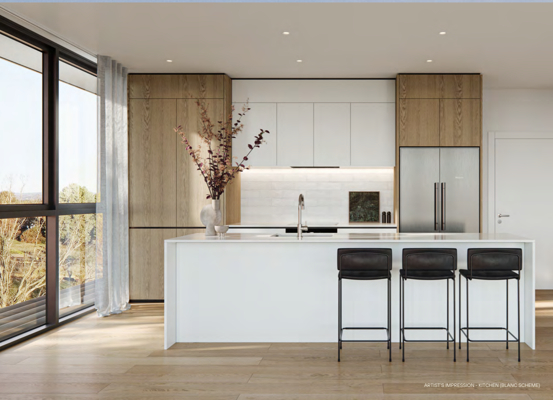
ARTIST'S IMPRESSION - KITCHEN (BLANC SCHEME)

Designed with a minimalistic approach using light and natural tones throughout. The Blanc colour scheme is sophisticated and chic, bringing natural beauty throughout.